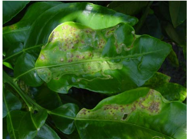
The Citrus Leafminer

considerably. If properly timed, applications of petroleum oil, Agri-mek, Micromite, Spintor, or Assail will reduce damage by leafminer. Late summer flushes tend to be erratic and effective control at that time will probably be difficult.