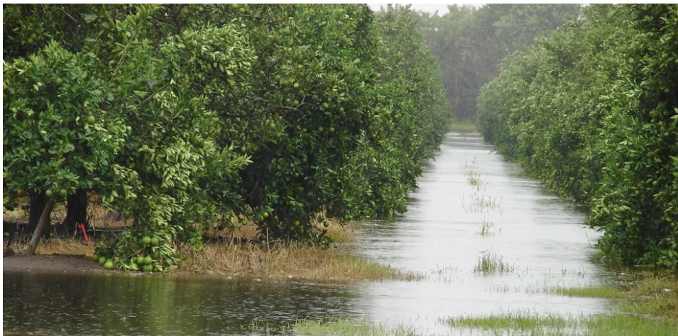
Flooded citrus grove after a heavy summer rain event.

Flooding injury is highly probable if the root zone is saturated for 3 or more days during the summer when soil temperatures (86-95°F) are relatively high. Flooding during the cooler December-March period can be tolerated for several weeks at low soil temperatures (< 60° F). The rate of oxygen loss from the soil is much greater at higher than at lower temperatures. The potential for damage to roots is less obvious, but equally serious, when the water table is just below the surface. Flooding stress is much less when water is moving than when water is stagnant. The use of observation wells is an easy and a quick method for evaluating water-saturated zones in sites subject to chronic flooding injury (See “Water Table Measurement and Monitoring in Citrus Groves”, Citrus Industry magazine, May 2015 issue).