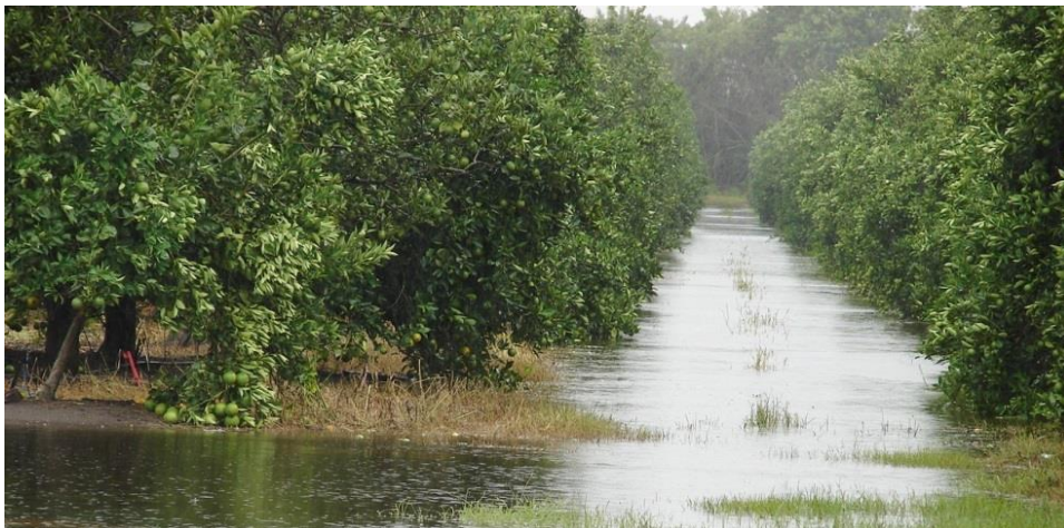
Flooded citrus grove after a heavy summer rain event.

Flooding injury is highly probable if the root zone is saturated for 3 or more days during the summer when soil temperatures (86-95°F) are relatively high. Flooding during the cooler December-March period can be tolerated for several weeks at low soil temperatures (< 60° F). The rate of oxygen loss from the soil is much greater at higher than at lower temperatures. The potential for damage to roots is less obvious, but equally serious, when the water table is just below the surface. Flooding stress is much less when water is moving than when water is stagnant. The use of observation wells is an easy and a quick method for evaluating water-saturated zones in sites subject to chronic flooding injury (See “Water Table Measurement and Monitoring in Citrus Groves”, Citrus Industry magazine, May 2015 issue).