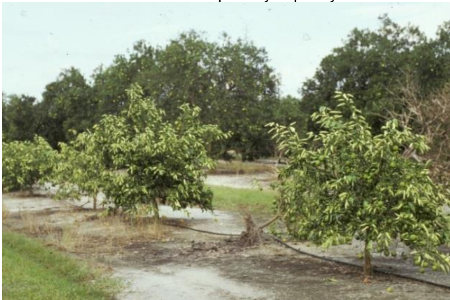
Flooding damage causing severe leaf wilt.

With acute water damage, foliage wilts and sudden heavy leaf drop follows. Trees may totally defoliate and actually die. More frequently, partial defoliation is followed by some recovery. However, affected trees remain in a state of decline and are susceptible to drought when the dry season arrives because of the shallow, restricted, root systems. Moreover, waterlogged soil conditions, besides debilitating the tree, are conducive to the proliferation of soil-borne fungi such as Phytophthora root and foot rot. These organisms cause extensive tree death especially in poorly drained soils.