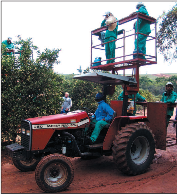
Figure 2. Scouting from an elevated platform.

is present within the property or located nearby, growers may apply up to 12 to 18 applications of various pesticides per year.